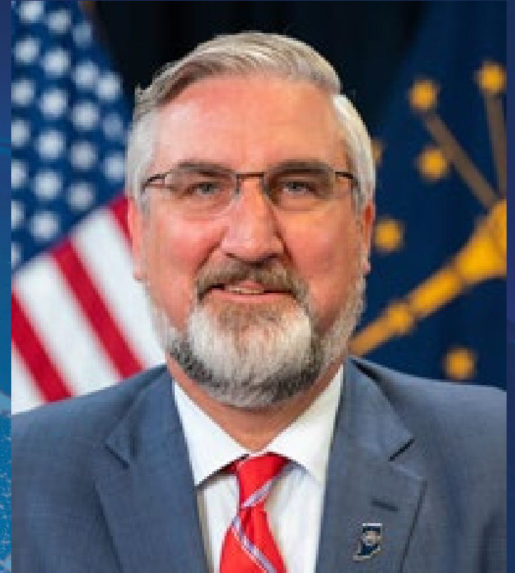
Eric J. Holcomb Governor, State of Indiana

“Indiana is uniquely positioned to play a leading role in shaping the 21st century global economy.”