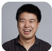
Liu Wei CEO of Baidu Ventures

The previous conferences invited governments, hospitals, universities, innovative companies, listed companies, investment institutions, industry researchers, etc. The total number of guests exceeded 600, with a year-on-year increase of 169%.