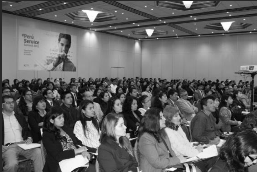
SPECIALIZED CONVENTIONS AND WORKSHOPS