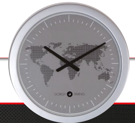
HANDI 450 world face