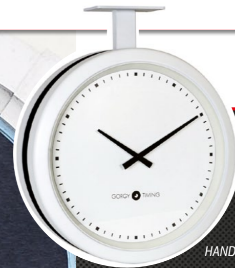
HANDI 450 double face