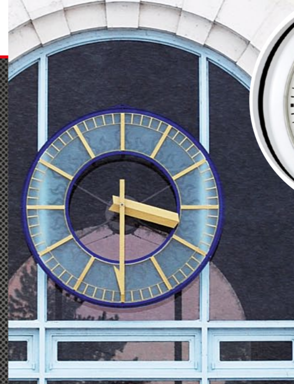
Auxerre Station Clock

** Contact our sales team for a personalized project.