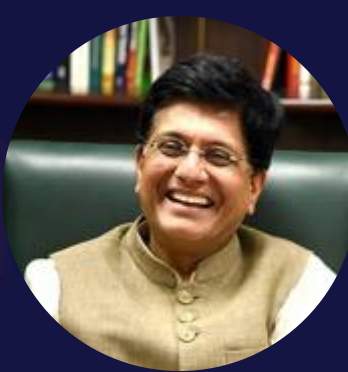
Shri Piyush Goyal Honourable Minister of Commerce and Industry, Minister of Consumer Affairs, Food and Public Distribution, and Minister of Textiles Government of India