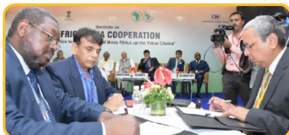
MOU BETWEEN LIMPOPO AGRICOLA EDESENVOLVIMENTO LDA & GUJARAT AGRO INDUSTRIES CORPORATION (GAIC).