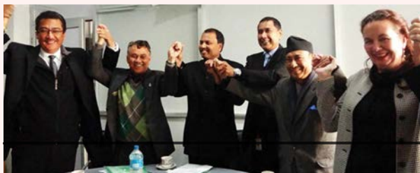
Minister and Secretary of Industry Ministry, IFC Chief and CNI President among others after signing the agreement