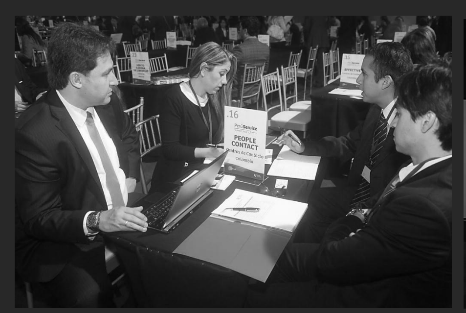
Perú Service SUMMIT 2013